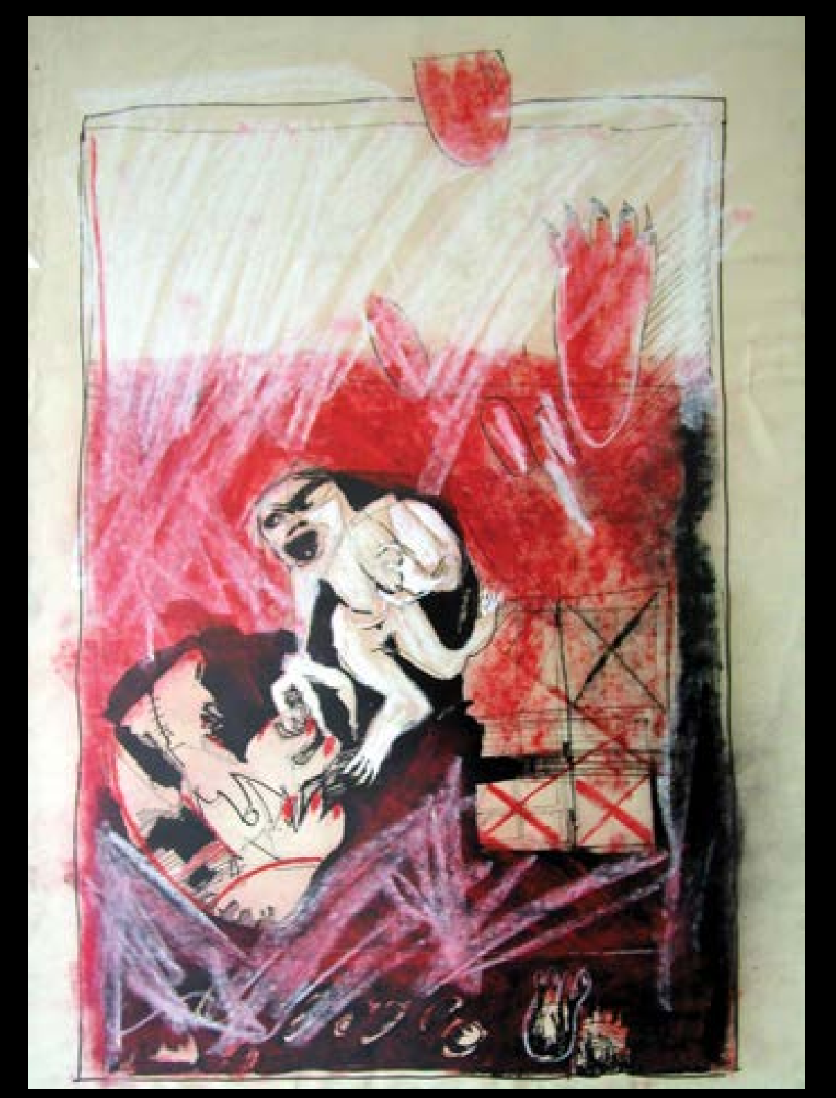
Untitled 1 Wrong and Right series, 1982, Acrylic and pastel on paper, 50x70cm, Courtesy of the Artist.