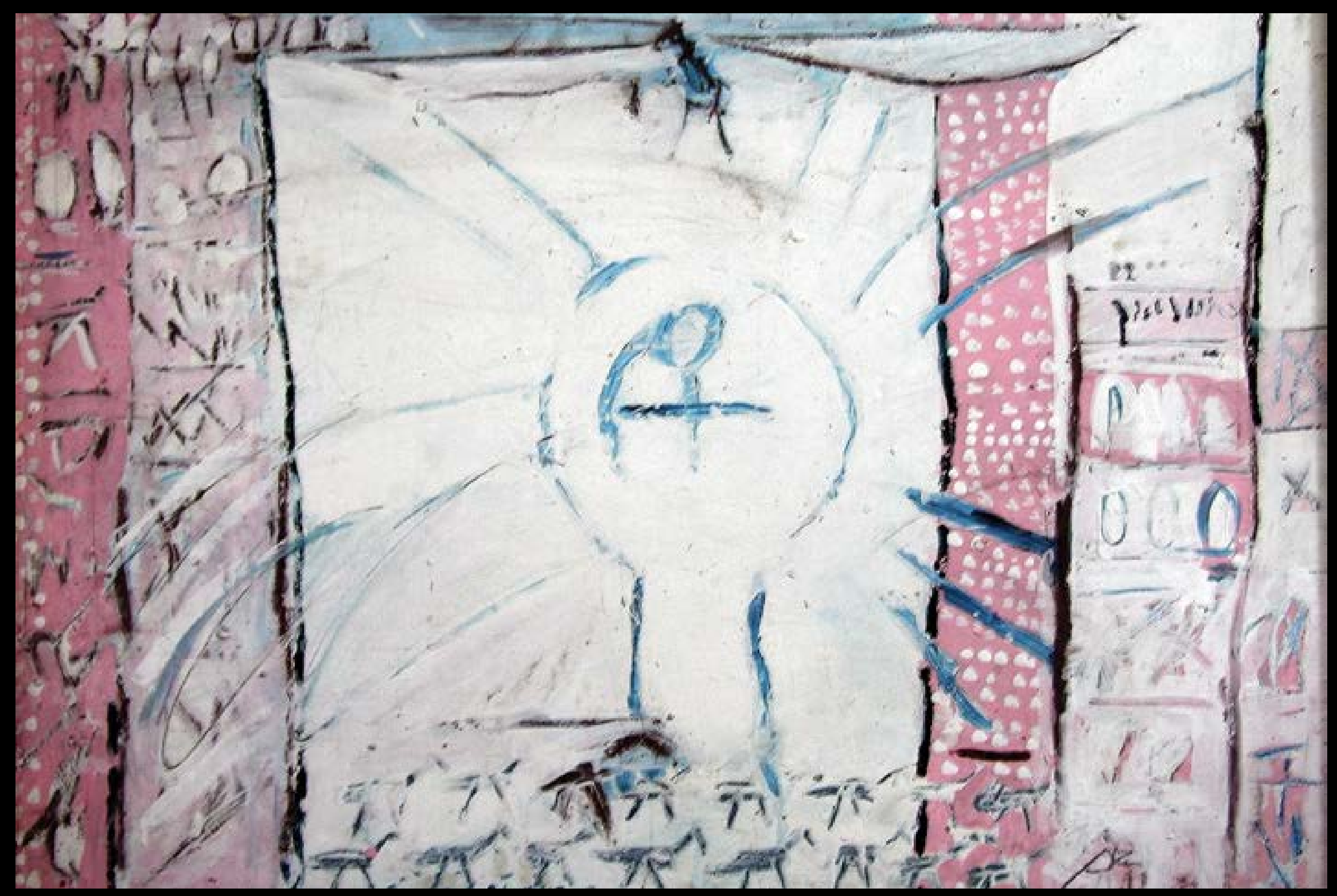
The Commonist are Back, 1987, acrylic and pastil on wood, 70x100cm, Courtesy of a Private Collection.

Hussein act as social thermometer where he with full enthusiasm tackled sensitive emergent phenomena during his youth time such as racism, and radicalism. While subjects like religion, sex. and politics considered as untouchable and a real taboo, Hussein's stubborn nature, as well his neutral position toward all religions and other's beliefs, he used clear sexual gestures "female and male signs". "Harte", "Angels" "Cross" beside "half moon" and "David star", such as the paintings "Jesus" 1993-99 and "Welcome to the Hill" from 1999.