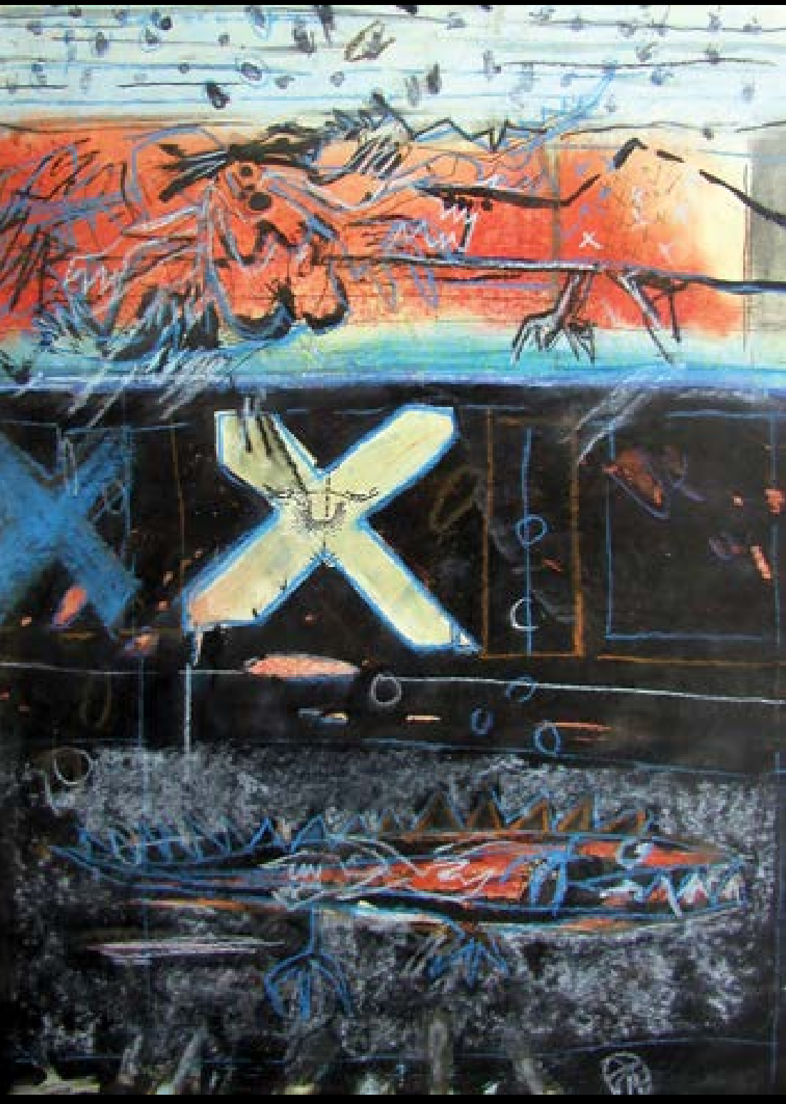
Untitled 2 Wrong and Right series, 1982. Acrylic and pastel on paper, 50x70cm, Courtesy of the Artist.